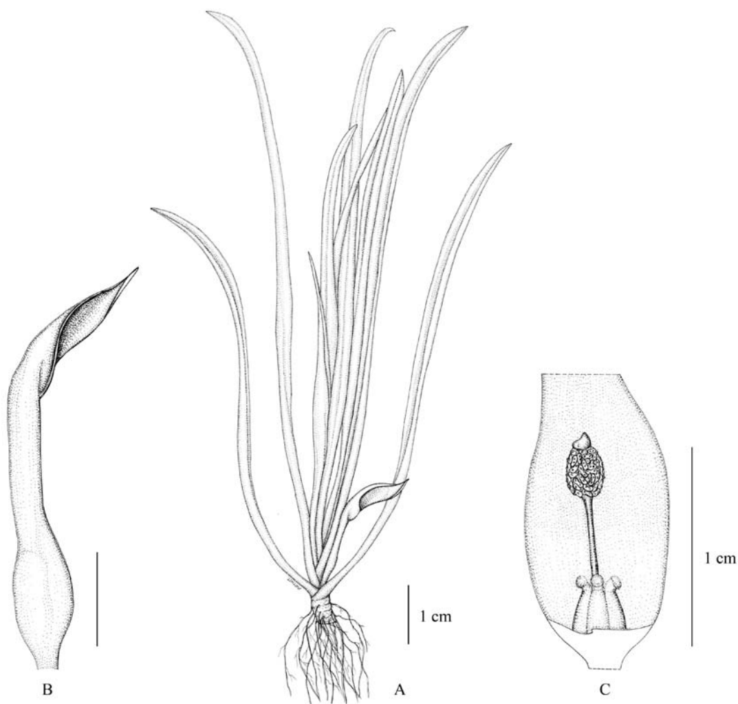
Figure 2. Cryptocoryne loeiensis J.D.Bastmeijer, T.Idei & N.Jacobsen: A. habit; B. spathe; C. inflorescence. Drawn by Arthit Kamgamnerd.

Ecology.— The species grows on river banks that are exposed during the dry season from February to April (Mekong River Commission, River Monitoring, 2009), partly in full sun. In such